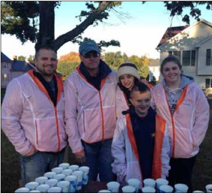
A group of our volunteers spending time on the course helping out at a water station.

We are forming a committee now to help grow our team for next year. Email scapozza@hotmail.com or info@camprisingsun.com to sign on.