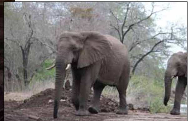
Personal pictures taken on safari October 2013.