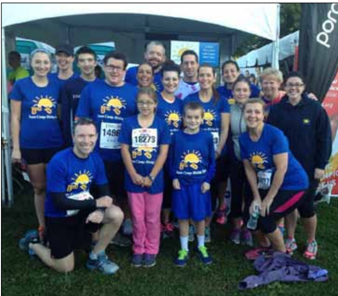
Camp Rising Sun's 2013 running and fundraising team. A huge thank you to all who sponsored our runners.